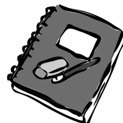
Percent of Grade